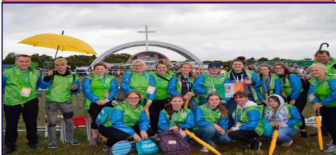
Spirit Members and their Leaders who served as Eucharistic Ministers at the Papal Mass in Phoenix Park during World Meeting of Families 2018